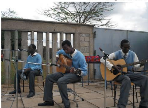
Photo: Form 2 band doing their thing